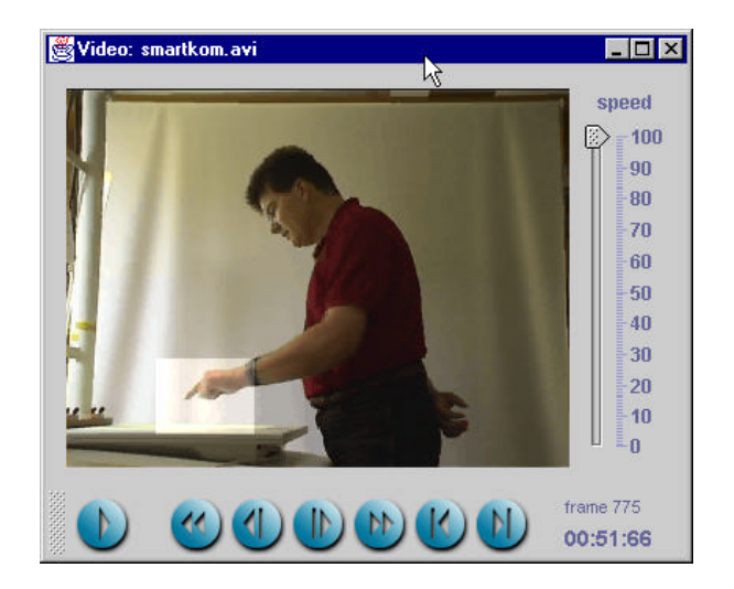
Figure 3: The video annotation plug-in

The second plug-in currently realized in Anvil is used to insert mark-up information directly into the video data. The user can link each annotation tag with a tag in the video stream (see Figure 3). A gesture's main stroke is marked with a highlighted rectangle.